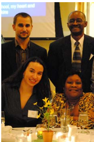
2011 Fundraiser More photos are on our website: www.dominican-center.org

The Dominican Center for Women partners with the community to maintain and enhance a beautiful, stable, healthy and safe neighborhood consisting of residents who are community-minded and are striving to be meaningfully educated and employed.