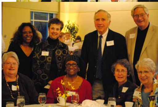
Photos from our 2011 Fundraiser - see more photos at our website or on Facebook