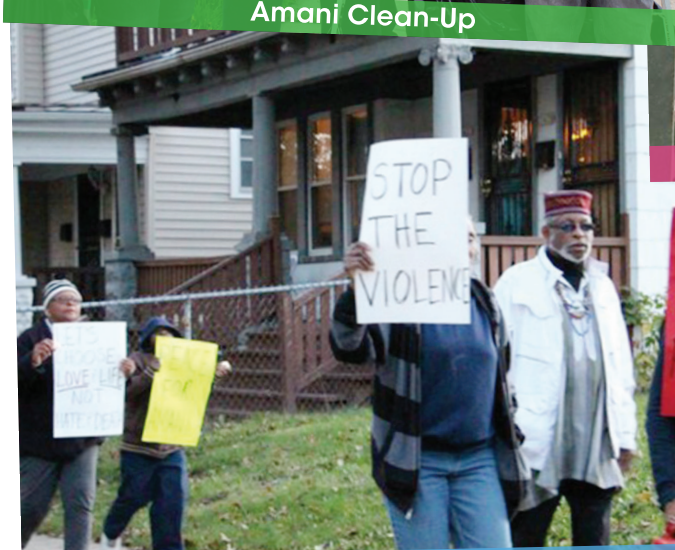
Stop The Violence