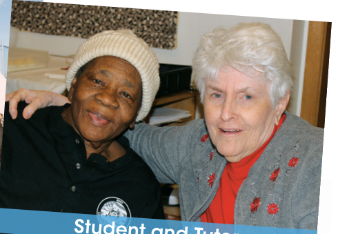
Student and Tutor