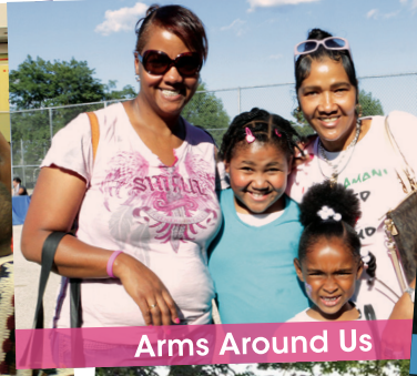
Arms Around Us