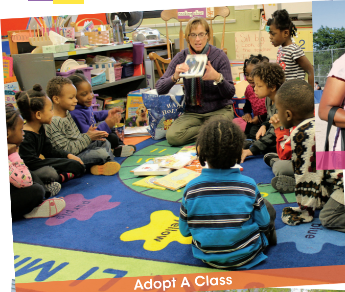
Adopt A Class