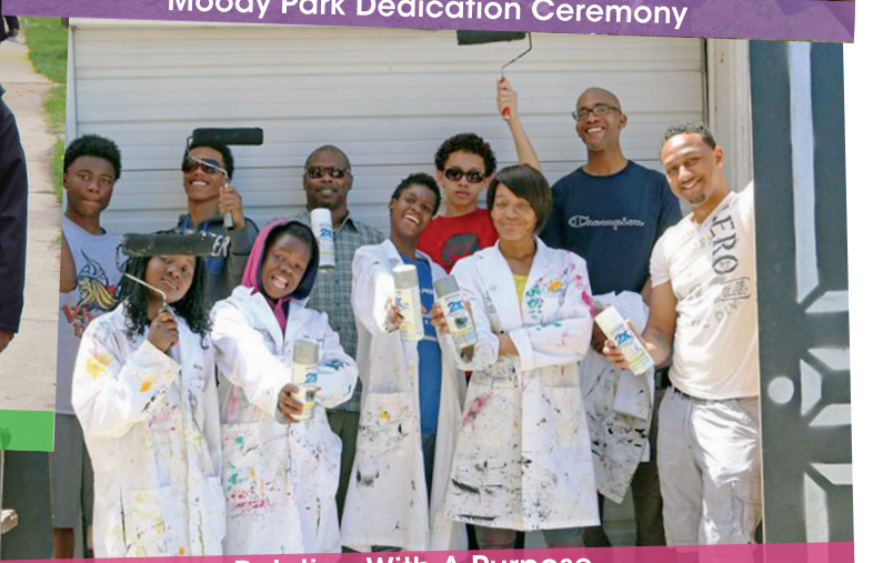
Painting With A Purpose