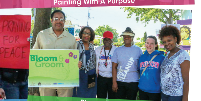
Bloom & Groom