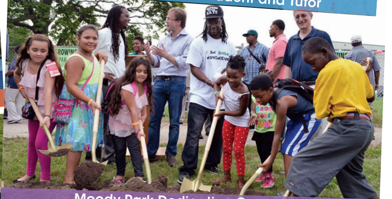
Moody Park Dedication Ceremony